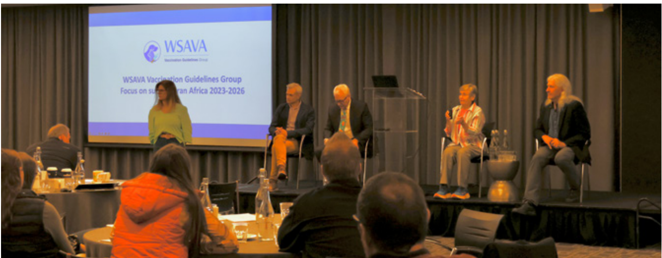
Members of the Vaccination Guidelines Group running a CE session in South Africa