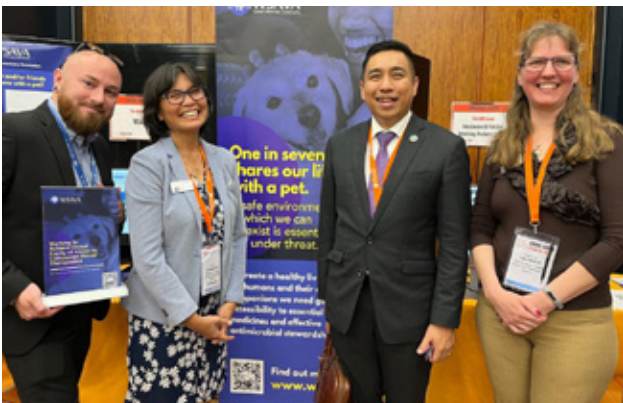
Promoting our campaign for equitable access to veterinary medicines during the WOH General Session

Our members must have access to the veterinary drugs they need so we will drive forward our campaign during 2024. We will build on our relationship with WOH and look forward to playing an active role in relevant WOH committees and seeking out additional partners to help us reach governments and regulators. We will also promote the latest and updated edition of the Essential Medicines List for Cats and Dogs. We are determined to bring about the change that is so urgently needed.