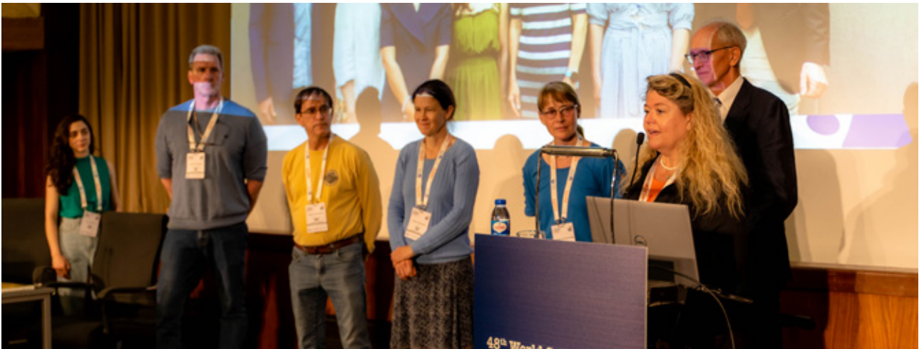
Members of the Reproduction Control Committee previewing their new Global Guidelines during the General Assembly